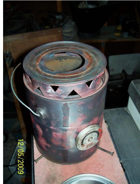
Figure 4: Completed TLUD

The last piece of the 1G Toucan is a chimney. A chimney ensures that sufficient secondary air is introduced through the side openings of the Crown and sweeps the secondary flames up through the center opening. It also improves the combustion by containing the flame in a turbulent vertical column. Figure 5 shows a 4" diameter by 24" tall chimney, using a piece of galvanized duct (from the hardware store). Alternately, a #5 can, 4" in diameter and 7" tall, can be used – this is the typical 46 ounce juice can size.