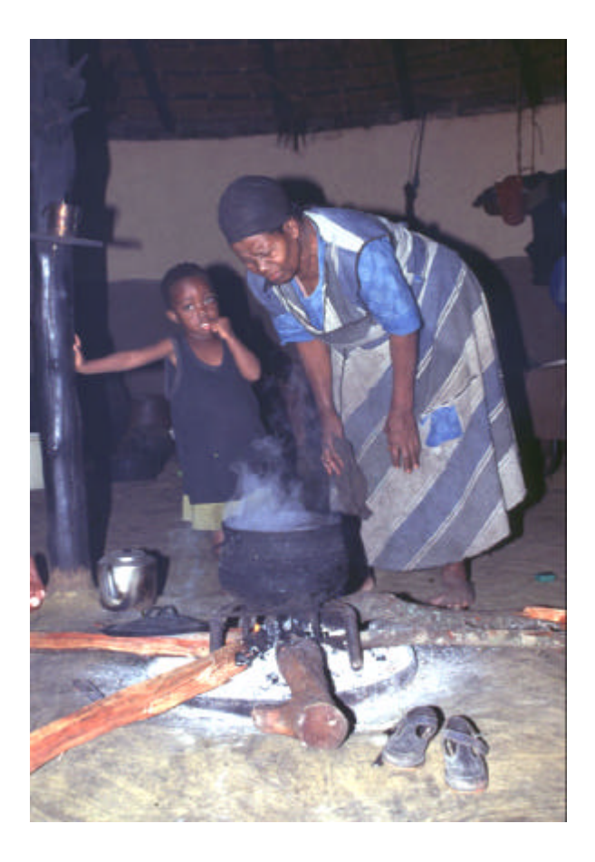
Figure 1: A rural home in Kwa-Zulu Natal

Indoor air pollution can be traced to prehistoric times when humans first moved to temperate climates approximately 200,000 years ago. These cold climates necessitated the construction of shelters and the use of fire indoors for cooking, warmth and light. Ironically, fire, which allowed humans to enjoy the benefits of living indoors, resulted in exposure to high levels of pollution as evidenced by the soot found in prehistoric caves (Albalak, 1997). It has been estimated that approximately half the world's population, and up to 90% of rural households in developing countries, still rely on biomass fuels (WRI, 1999). Typically burnt indoors in open fires or poorly functioning stoves, this leads to levels of air pollution that are among the highest ever measured. Figure 1 shows a typical kitchen in a rural developing country setting, with blackened timbers and roof.