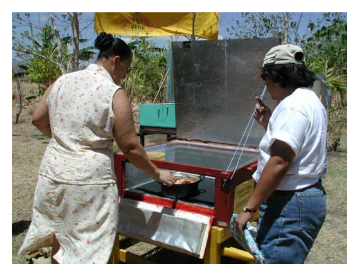
One of several solar cooked dishes for lunch