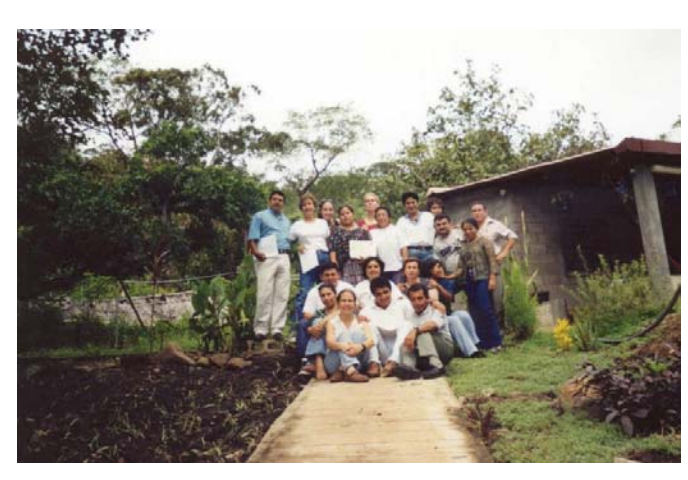
El Salvador/Guatemala/Mexico workshop participants