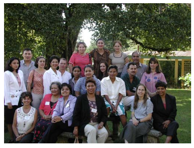
Costa Rica/Panamá Workshop Participants