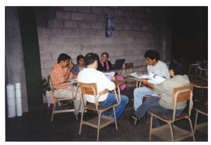
Working group analyzing a case study