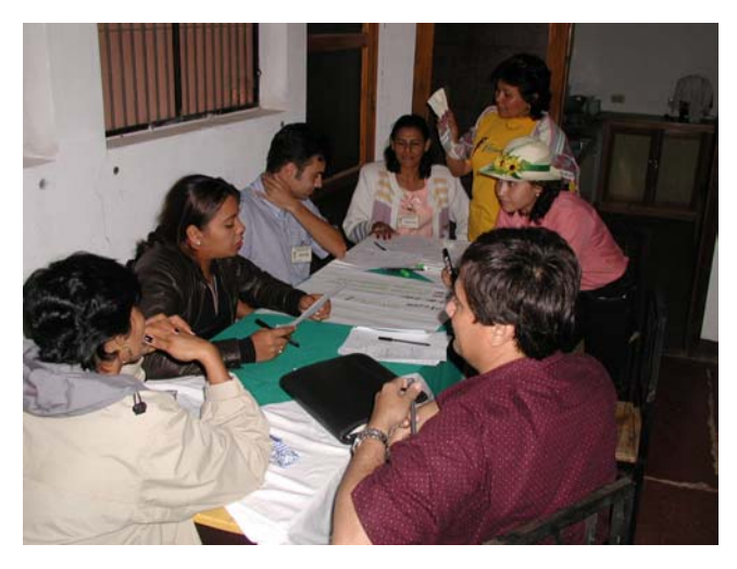
Working group discusses "access and control" exercise