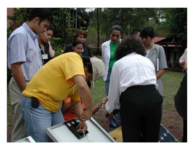
Participants getting hands-on experience with solar electricity