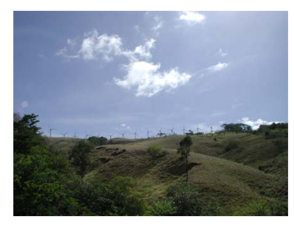
One of six wind farms in Costa Rica