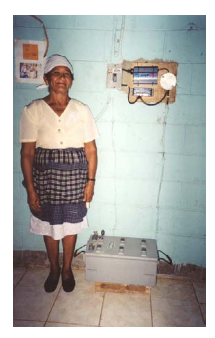
Local women use solar PV to operate the package sealer for fruit to be commercialized