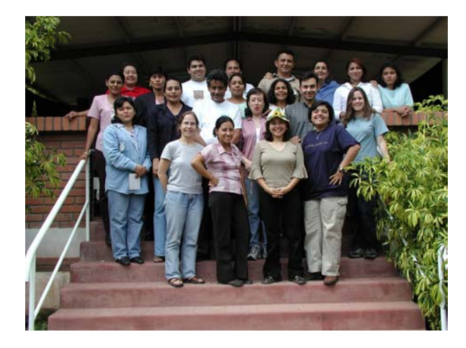
Honduras/Nicaragua Workshop Participants