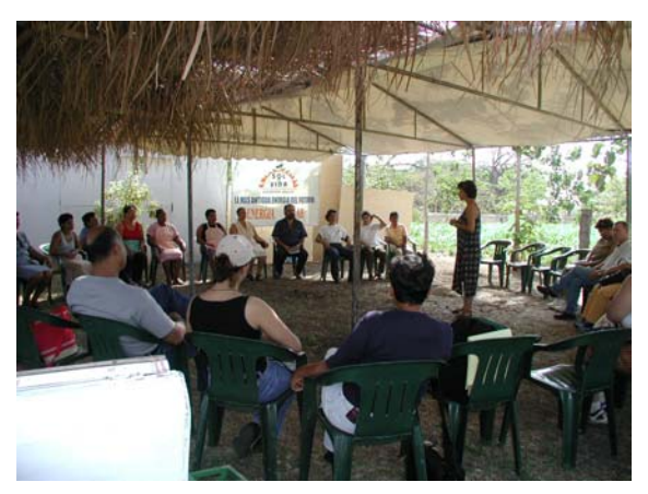
Discussion between participants and solar oven users at Casa del Sol