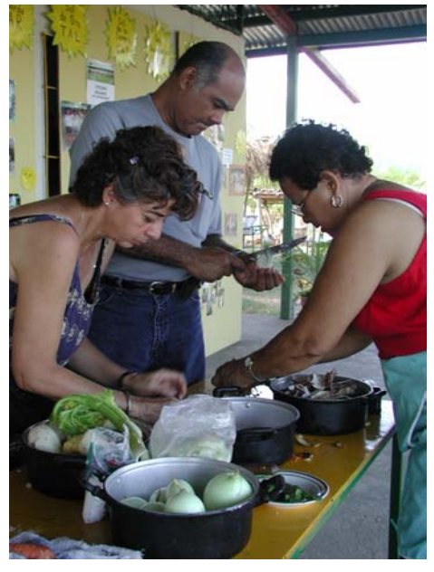
Preparing food to be cooked in the solar cooker