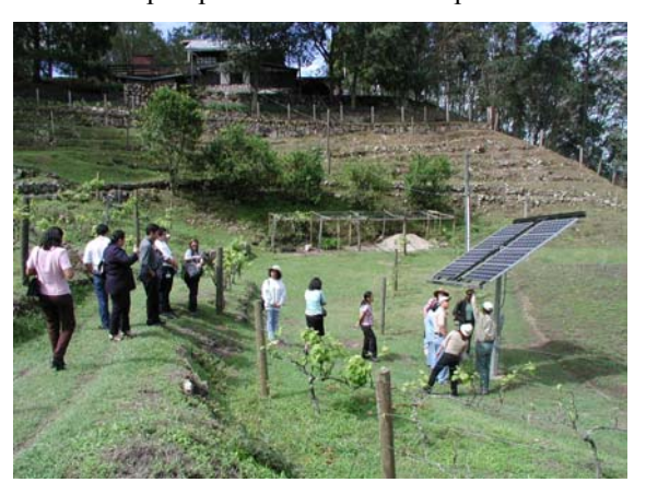
Visiting a solar-powered vineyard