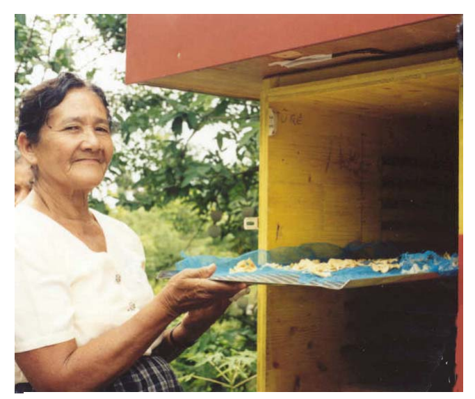
Solar fruit drying allows the women to market valueadded products and generate extra income